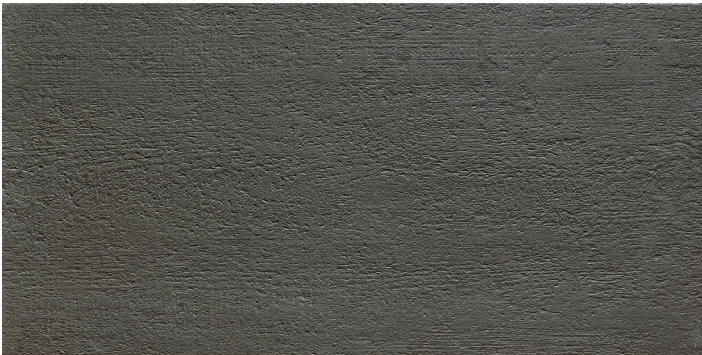
WPM00013 ANTRACITE 12"x24"x3/8" Rectified Porcelain