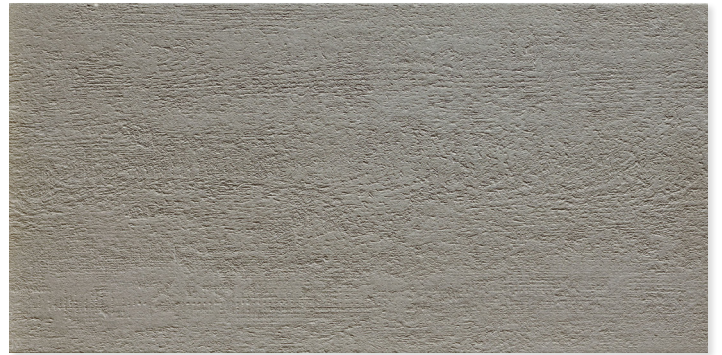
WPM00012 DIMGRAY 12"x24"x3/8" Rectified Porcelain