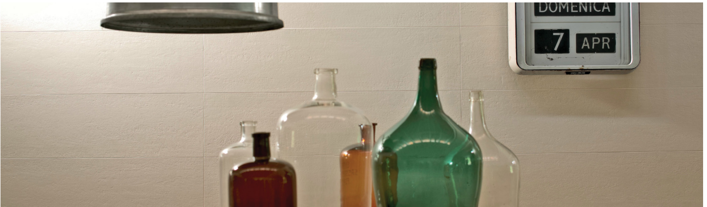
Product Featured: Snow