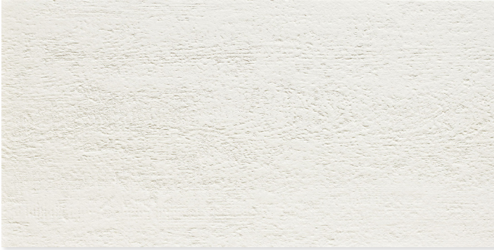
WPM00010 SNOW 12"x24"x3/8" Rectified Porcelain