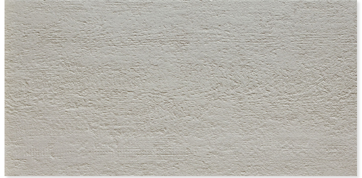
WPM00011 SILVER 12"x24"x3/8" Rectified Porcelain